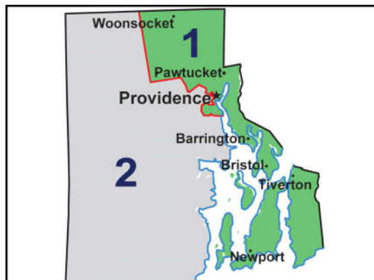
Congressional District - 1

B. F. Metals Bullard Abrasives Inc. Construct Oil Co., Inc. D. L. Thurrott, Inc. Encore Holding, LLC Hallman Septic Service Martins Maintenance, Inc. National Business Furniture, Inc. Nepco Products Co. Nicolson Cutter Grinding & Supply ODEH Eng., Inc. Raytheon Co. Sid Tool Co., Inc. Walco Electric Co. Zodiac Tool & Cutter Grinding