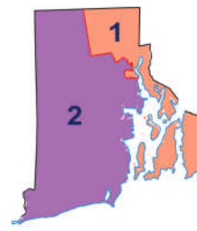
Rhode Island - 2 Districts