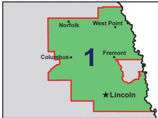
Congressional District - 1