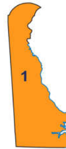
Delaware - 1 Districts