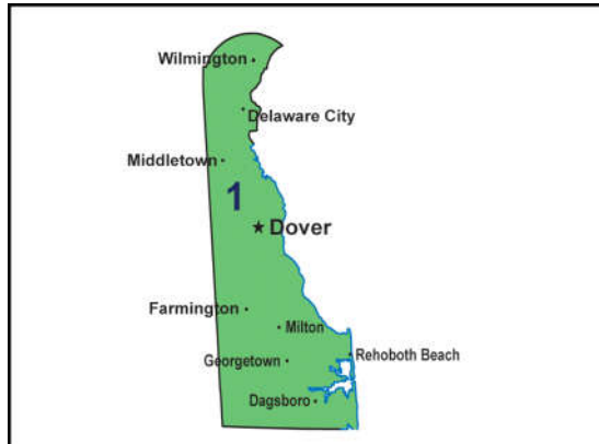
Congressional District - 1

Keen Compressed Gas Co. SSS Clutch Co., Inc. Waters Tech. Corp.