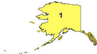
Alaska - 1 District