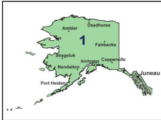
Congressional District - 1