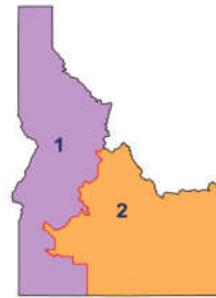
Idaho - 2 Districts