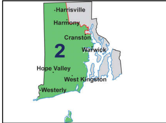
Congressional District - 2

W. W. Grainger, Inc. Warwick Hotel Associates Xpress Sweeping, Inc.