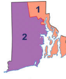
Rhode Island - 2 Districts