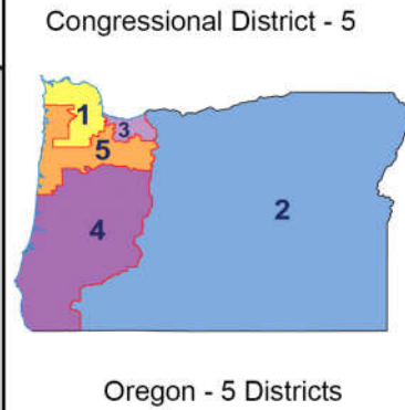
Oregon - 5 Districts