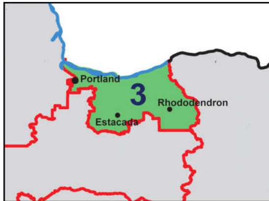
Congressional District - 3