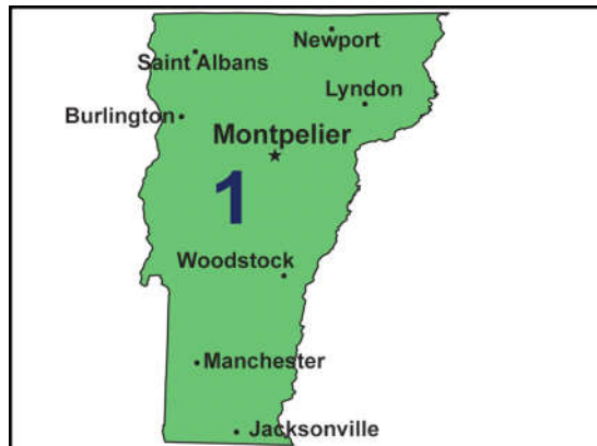
Congressional District - 1