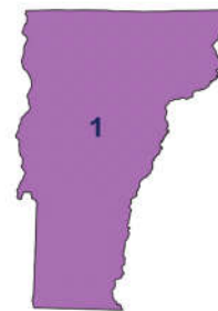
Vermont - 1 District