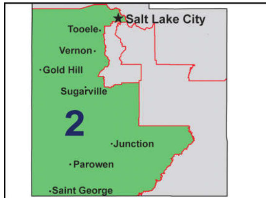
Congressional District - 2

Huish Outdoors, LLC Scientific Toolworks, Inc.