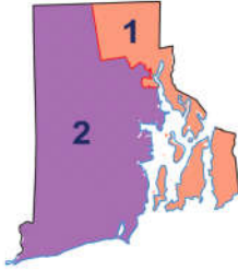
Rhode Island - 2 Districts