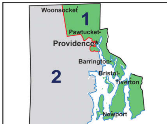
Congressional District - 1

Anchor Insulation Co., Inc. Bristol Harbor Group, Inc. Construct Oil Co., Inc. Department of the Navy Encore Holdings, LLC Ferguson Perforating Co., Inc. Hart Engineering Corp. J. H. Lynch & Sons, Inc. Jade Engineered Plastics, Inc. Martin's Maintenance, Inc. Narragansett Improvement Co. NEPCO Products Co. Nicolson CGS Co., Inc. R. Keough Construction, Inc. Raytheon Co. Shred-It USA JV, LLC Walco Electric Co.