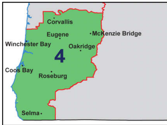
Congressional District - 4