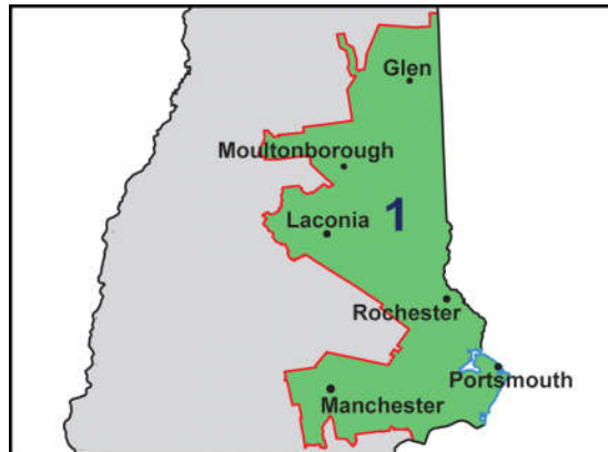
Congressional District - 1