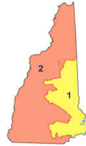
New Hampshire - 2 Districts