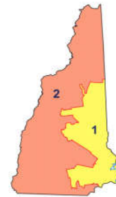
New Hampshire - 2 Districts