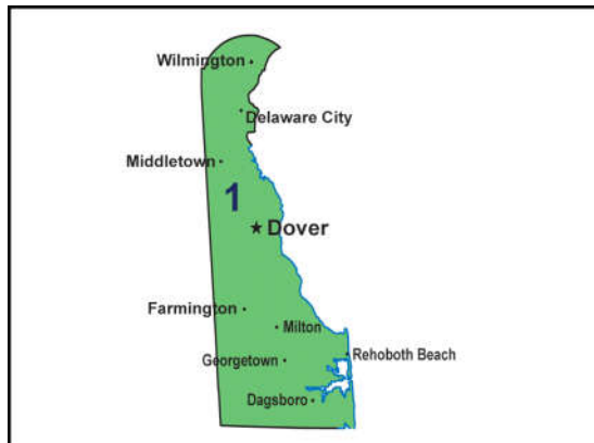
Congressional District - 1