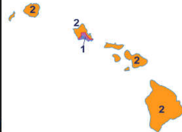
Hawaii - 2 Districts