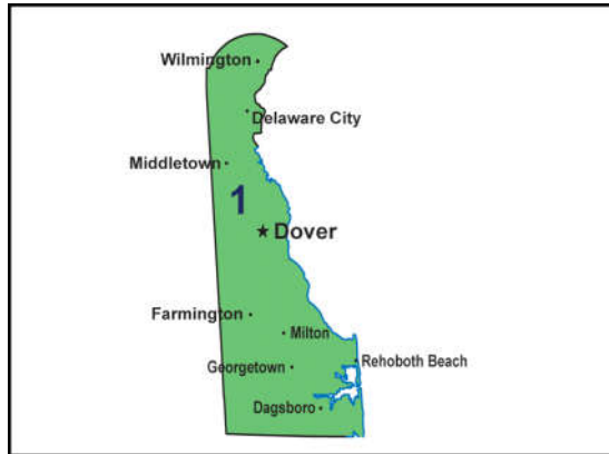
Congressional District - 1

Micropore SSS Clutch Co., Inc. Versitron, Inc.