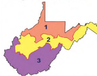
West Virginia - 3 Districts