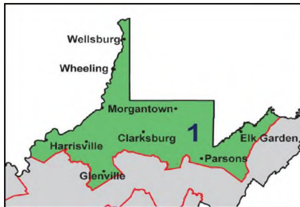
Congressional District - 1