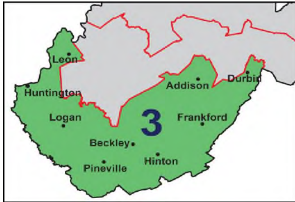
Congressional District - 3

BEK Eng. Corp. Huntington Alloys Corp. Level 1 Fasteners