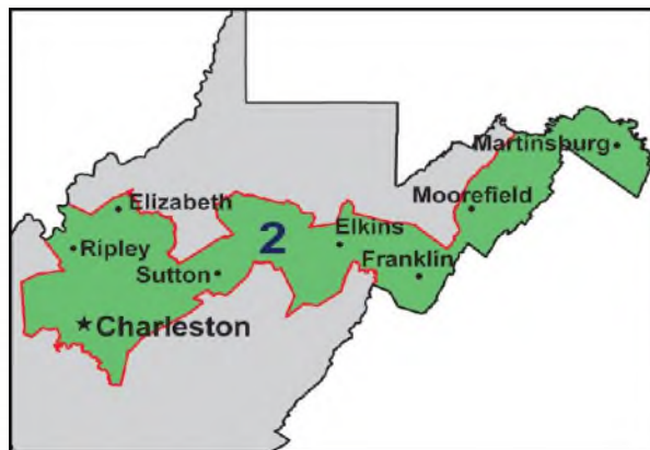
Congressional District - 2

Cyclops Ind., Inc. O'Neal Steel, Inc. Vimasco Walhonde Tools, Inc.