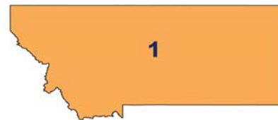
Montana - 1 District