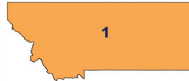
Montana - 1 District