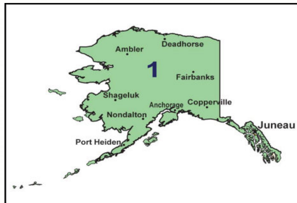
Congressional District - 1