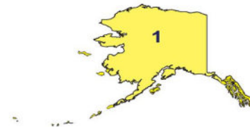
Alaska - 1 District