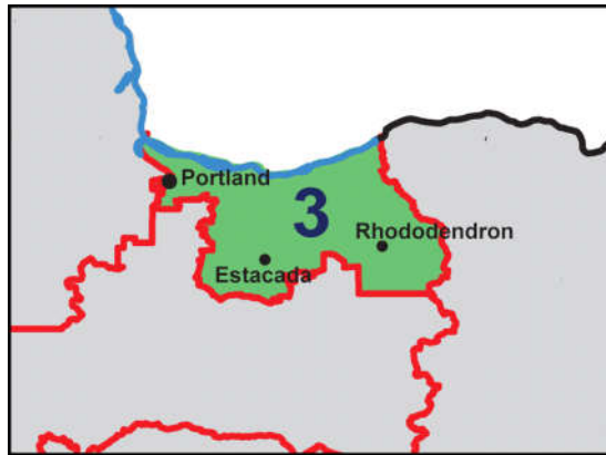
Congressional District - 3