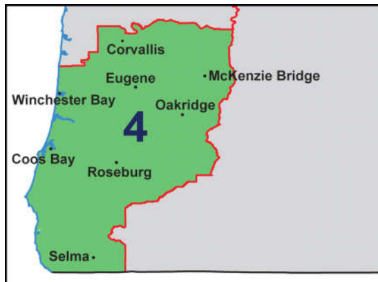
Congressional District - 4