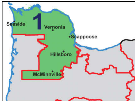
Congressional District - 1

Climax Portable Machine Tools, Inc. Tektronix, Inc.