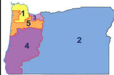
Oregon - 5 Districts