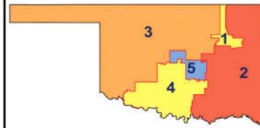
Oklahoma - 5 Districts