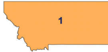
Montana - 1 District